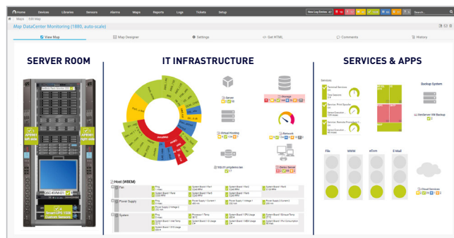
Your data center at a glance